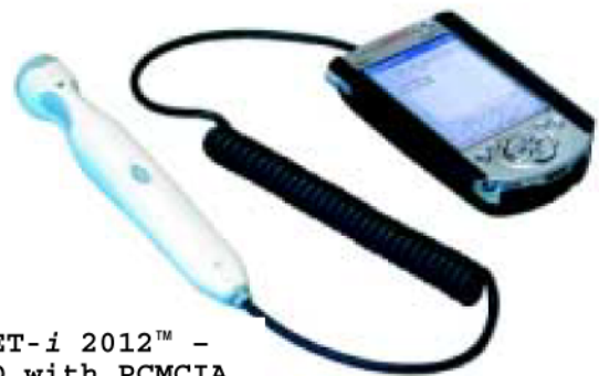
JET-i 2012™ - HD with PCMCIA Card and Compaq iPAQ